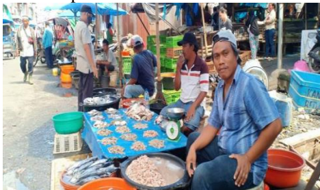
Fig 3. The trader who does not wear a mask during a trade transaction at the Karan Fish Auction Market.

Evaluation: 1) COVID-19 preventive implementation generally goes as planned; 2) while conducting preventive measures, there are still many people who do not behave well in the prevention of the spread of Coronaviruses, such as not keeping the distance at the time of communication, there is a gathering of citizens who are more than 5 people without wearing masks, and 3) when providing counselling to shop owners/stalls at the fish auction where the importance of providing water and soap for hand wash ready actions. In general, the shop/shop will apply the action, but there are also found shops/stalls that do not heed this preventative effort.