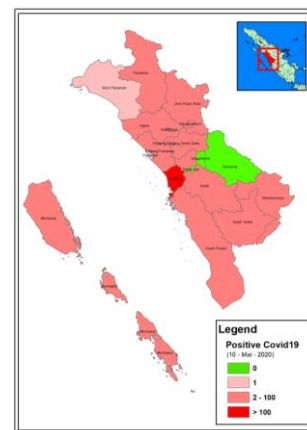
Fig 1. Map of COVID-19 Distribution in West Sumatra Province

The following is a map of the distribution of COVID-19 events in West Sumatra Province, dated 10 May 2020.