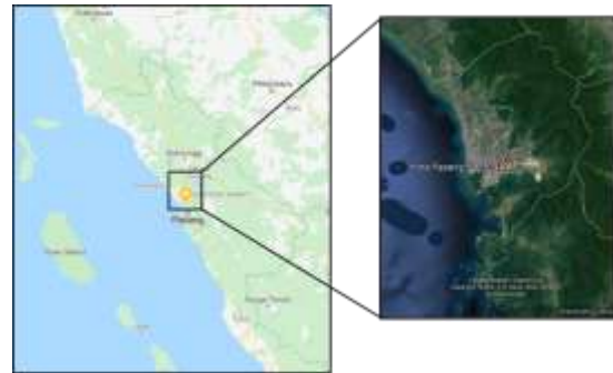
Fig.1. Study Area

Padang City is a city with a fairly high rainfall and rainfall frequency. The city of Padang was chosen as the research location because the city of Padang is the provincial capital which is experiencing rapid development. The increase in the development of the city of Padang will be inversely proportional to the reduction in water catchment areas and becoming a watertight area which causes rainwater to stagnate on the surface and cause flooding.