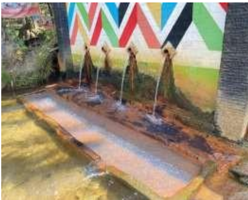
Fig 1. Sulfur Hot Springs

activity. The hot water contains minerals believed to have health benefits, such as relieving aches and pains, joint pain, and promoting relaxation. the surrounding area is relatively pristine, with dense trees and a peaceful rural atmosphere. this makes it suitable for nature tourism, health therapy, and even educational tours about geological phenomena [19]. the tourist attraction is managed by the Pawan village community with support from the village and sub-district governments.