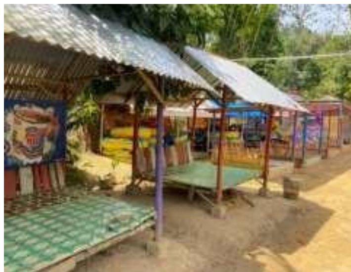
Fig 2. Family Cottage

Field observations indicate that supporting facilities are inadequate. some facilities were built independently, resulting in varying quality. This